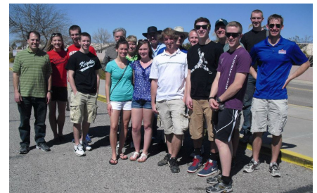
March 2 Canvassing Group

The canvassing date scheduled for May 4 has been canceled due to the Leadership Conference the same day.